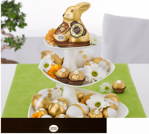
Ferrero Rocher Easter Eggs.